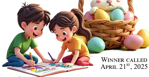
WINNER CALLED APRIL 21 ST , 2025

COLOR THE ATTACHED PAGE AND TURN IT IN TO THE LEASING OFFICE BY APRIL 18 TH , 2025 FOR A CHANCE TO WIN AN EASTER BASKET!!